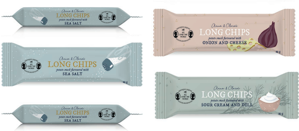
Anna & Clara`s/ private label in Denmark