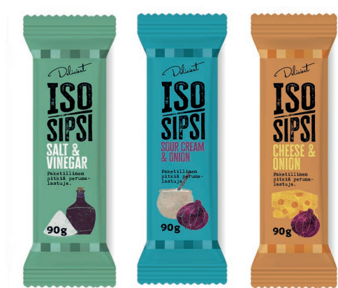
ISO SIPSI/ private label in Finland